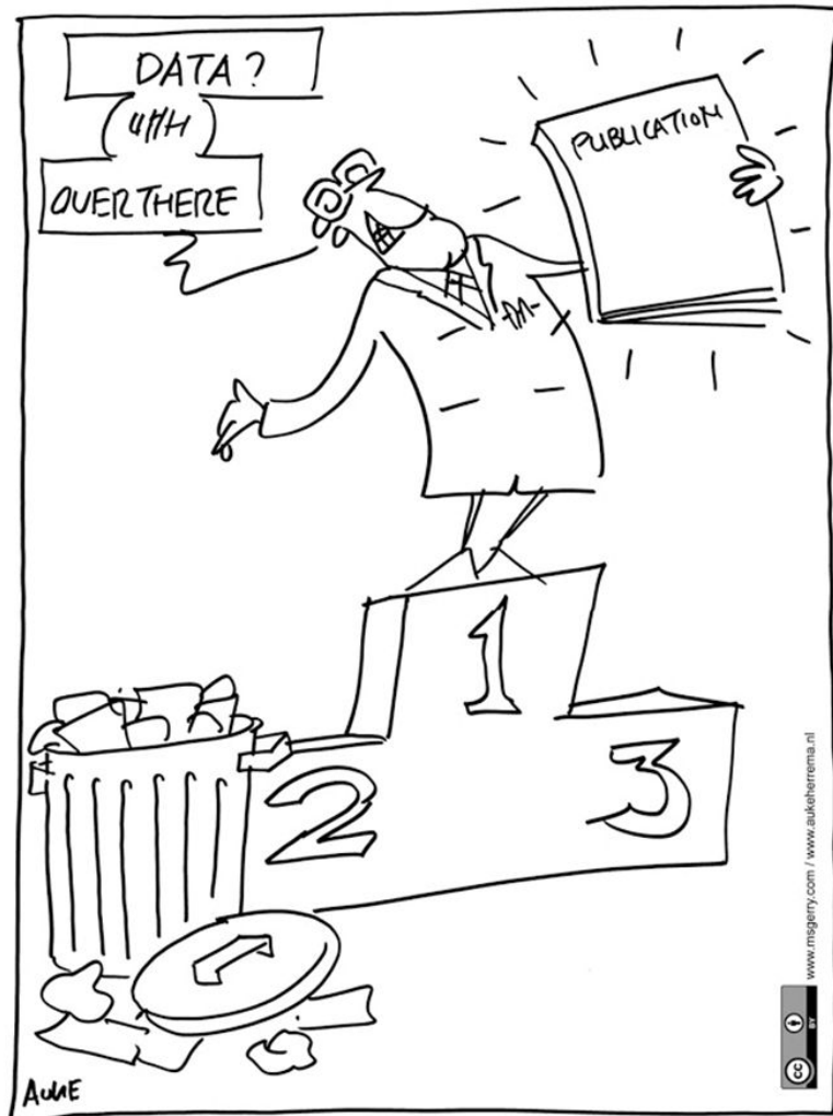
PUBLICATIONS AND DATA

It is expected that a Data Publication will ensure that data will potentially be considered as a first-class research output (Knowledge Exchange, 2013).